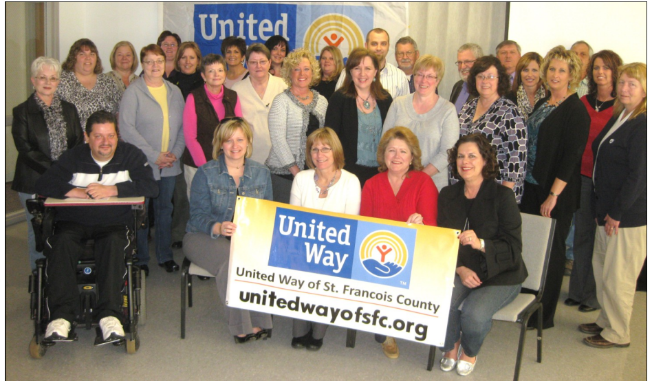
Representatives of the local agencies receiving United Way grants on Jan. 24 pose with the UW banner!